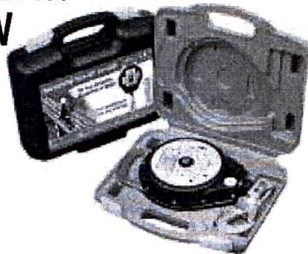
grey & black